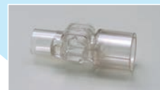
R804 YG-111T (4 cc dead space)