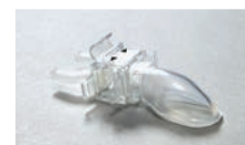
V923 YG-122T for oxygen cannula adjustment