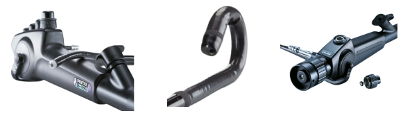
ENT SCOPES- VIDEO, FIBEROPTIC, RIGID