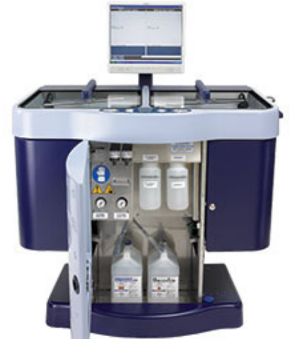
MEDIVATORS A Cantel Medical Company REPROCESSOR